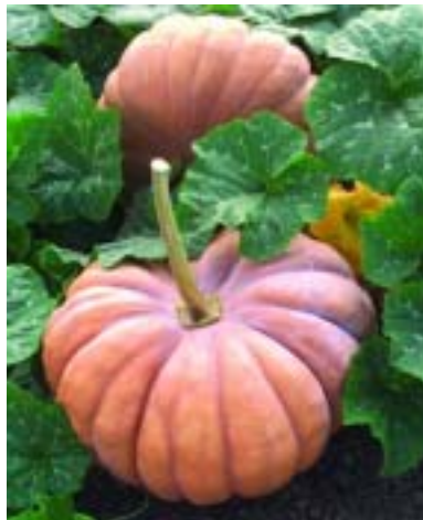
Rumbo Hybrid Winter Squash J.W. Jung Seed Co.