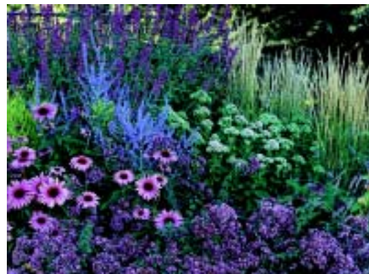
'August Afternoons' Perennial Garden High Country Gardens

The 'August Afternoons' Perennial Garden, which includes ornamental grasses and three new plant varieties, blooms in shades of blue, pink and ivory from mid-summer through early fall with blossoms that attract hummingbirds and butterflies. 'August Afternoons' thrives in USDA zones 5-9 in ordinary, well-drained soil in full sun. The collection includes one each of Miscanthus 'Silberfeder', Agastache x 'Ava' and Perovskia , two each of Echinacea 'Magnus' and Lavandula 'Hidcote Giant', three each of Calamagrostis 'Overdam' and Sedum 'Autumn Joy' and four Origanum x 'Rotkugel' for a total of 17 plants. The garden, which includes a planting diagram and maintenance guide, sells for $82.25 from High Country Gardens, 1-800-925-9387; www.highcountrygardens.com .