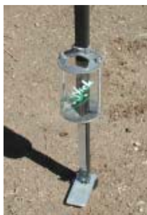
Seed Stick Planter Johnny's Selected Seeds