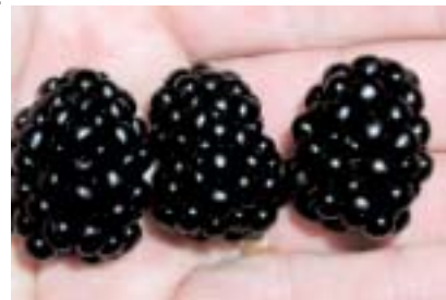
Prime-Jan® and Prime-Jim® Primocane-Fruiting Blackberries Stark Bro's Nurseries

Prime-Jan® and Prime-Jim® are unique in the world of blackberries because they are the first to produce berries on primocanes (first-year canes) as well as on floricanes (canes from the previous year). In climates where winter damage to floricanes reduces berry production the following summer, Prime-Jan and Prime-Jim will increase fruit yields. These new varieties will also allow a later season crop into the fall, which is not possible with current varieties. Prime-Jan and Prime-Jim are available from Stark Bro's, 1-800-325-4180, www.starkbros.com .