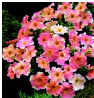
Petunia Flambé Park's Seeds

Petunia Flambé (also known as Dolce Flambé) is a new variety from Italy that is already taking Europe by storm. The merrily ruffled 3-inch-wide flowers are suffused with rose, lemon and cream tones over white. These long-lasting blooms are held wide open all over a compact 8-10 inch high and wide plant that's perfect for containers of all kinds and is a gorgeous addition to any garden. Flambé is a multilfora-type petunia, with masses and masses of flowers right up into autumn in mild climates. No two of these soft pastel flowers are exactly alike. Petunia Flambé is available from Park's Seeds, 1-800-845-3369, www.parkseed.com .