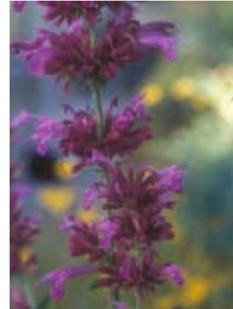
Ava's Hummingbird Mint High Country Gardens

Ava's Hummingbird Mint is a tall, robust herbaceous perennial, the result of hybridizing two native Southwestern U.S. species— Agastache cana and Agastache barberi . The large rose-pink flowers begin blooming in mid-summer and continue for months, and the raspberry-red calyxes retain their intense coloration, which keeps the plant beautiful until the first hard frost. This stunning plant is rabbit resistant, deer resistant and cold hardy in USDA zones 5-9. At maturity, Ava's Hummingbird Mint can reach 3-5 feet tall and 24 inches wide. Available from High Country Gardens, 1-800-925-9387; www.highcountrygardens.com .