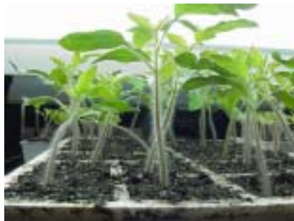
T8 Light Technology Gardener's Supply

Gardener's Gold, Green Guard, Garden Rich and Gardens Alive! are trademarks of Gardens Alive!, Inc.