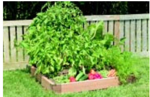
Gardens Alive!® Organic Garden Kit Gardens Alive!®

The Gardens Alive!® Organic Garden Kit contains virtually everything needed to grow fresh, homegrown vegetables. The kit includes four raised bed corner joints, one weed barrier mat, two 16-quart bags of Gardener's Gold™ Premium Compost, a tomato support, Green Guard™ Plant Growth Enhancer, and a two-pound bag of Garden Rich™ Fertilizer. Just add four 2" x 6" boards and your own topsoil. The Gardens Alive! Organic Garden Kit is available with 10 varieties of organic seeds for $74.95, or without seeds for $59.95. Exclusively from Gardens Alive!, (513) 354-1482, www.GardensAlive.com .