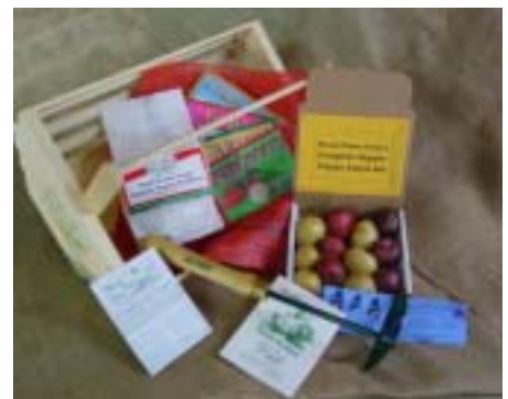
Complete Organic Potato Patch Kit Wood Prairie Farm

Here's everything you need to grow and enjoy a bumper crop of organic spuds from your garden. Included are four different varieties of Maine Double-Certified Organic Seed potatoes—early blue Caribé, popular Yukon Gold, beautiful Red Cloud and baking spud extraordinaire Elba. Plant, weed and harvest your crop of potatoes with a rugged American-made hand hoe. Fertilize with Wood Prairie Farm Organic Potato Fertilizer. At the end of the season, collect your harvest in the large Maine handcrafted wooden garden hod. The Complete Organic Potato Patch Kit, which also includes the Organic Potato Growing Guide and Potato Recipe Booklet, sells for $39.95 from Wood Prairie Farm, 1-800-829-9765, www.woodprairie.com .